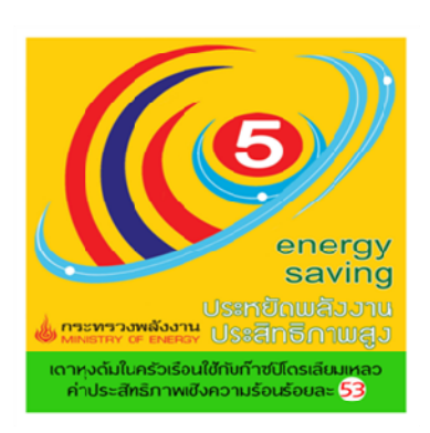
Labeling for non-electric products