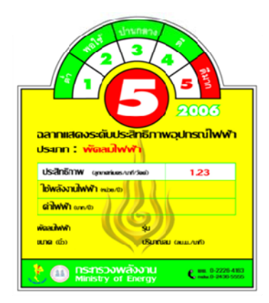
Labeling for electric products

To introduce manufacturer awareness to produce high energy efficiency products and push market transformation with market mechanism.