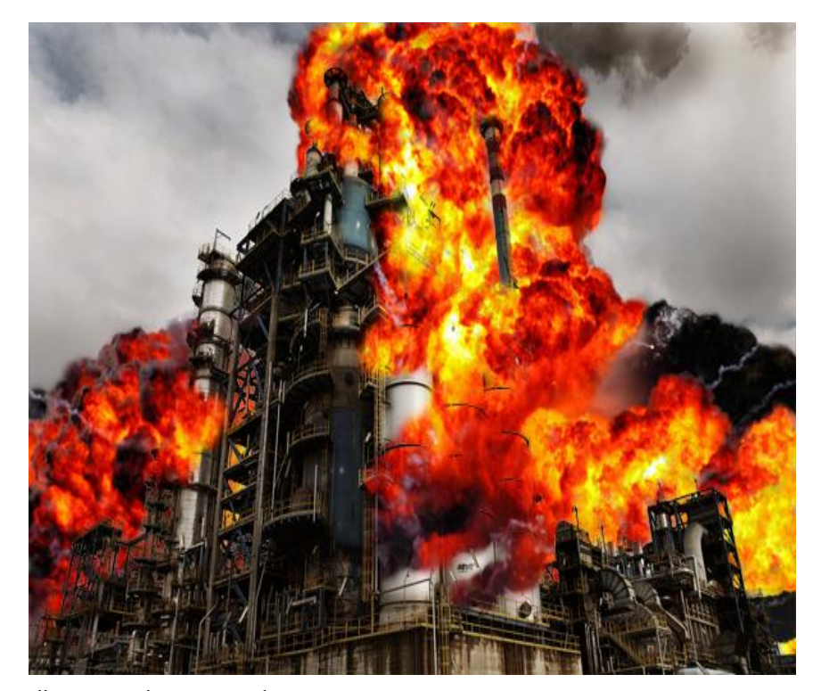
Illustration by Kong Yink Heay; <a href="http://magazine.scientificmalaysian.com/issue-6-2013/enhancing-safety-sustainability-malaysian-refineries/">http://magazine.scientificmalaysian.com/issue-6-2013/enhancing-safety-sustainability-malaysian-refineries/</a>