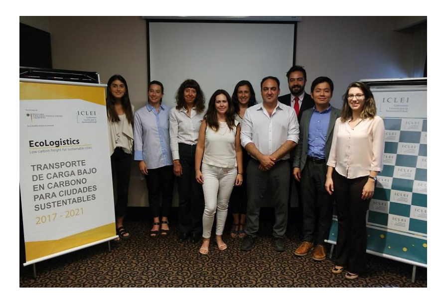
Release on Argentina

Cargo vehicles produce more emissions than those that carry passengers alone. In addition, difficulties in loading and unloading and navigating traffic contribute to serious environmental challenges. Led by ICLEI, EcoLogistics is designed to promote effective regulatory, planning and logistics tools at all levels of government to support low carbon urban freight. It is present in India, Argentina and Colombia. A key target for the project is the development of national policy recommendations based on the results observed in the project cities.