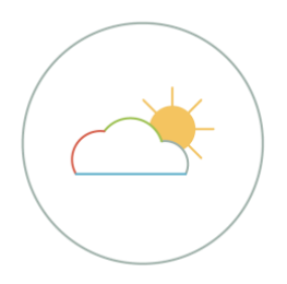
ONLINE TRAINING | CLIMATE ACTION PLAN