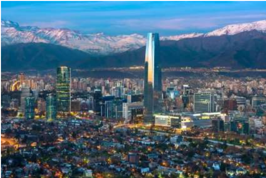
Sunset in Santiago, Chile.