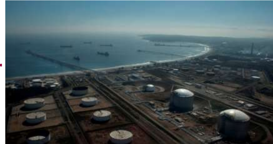
LNG regasification plant Quintero.