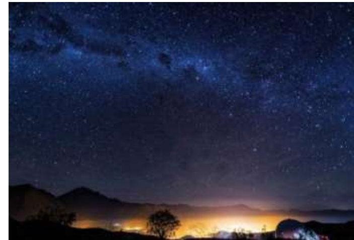
Elqui Valley, Chile.