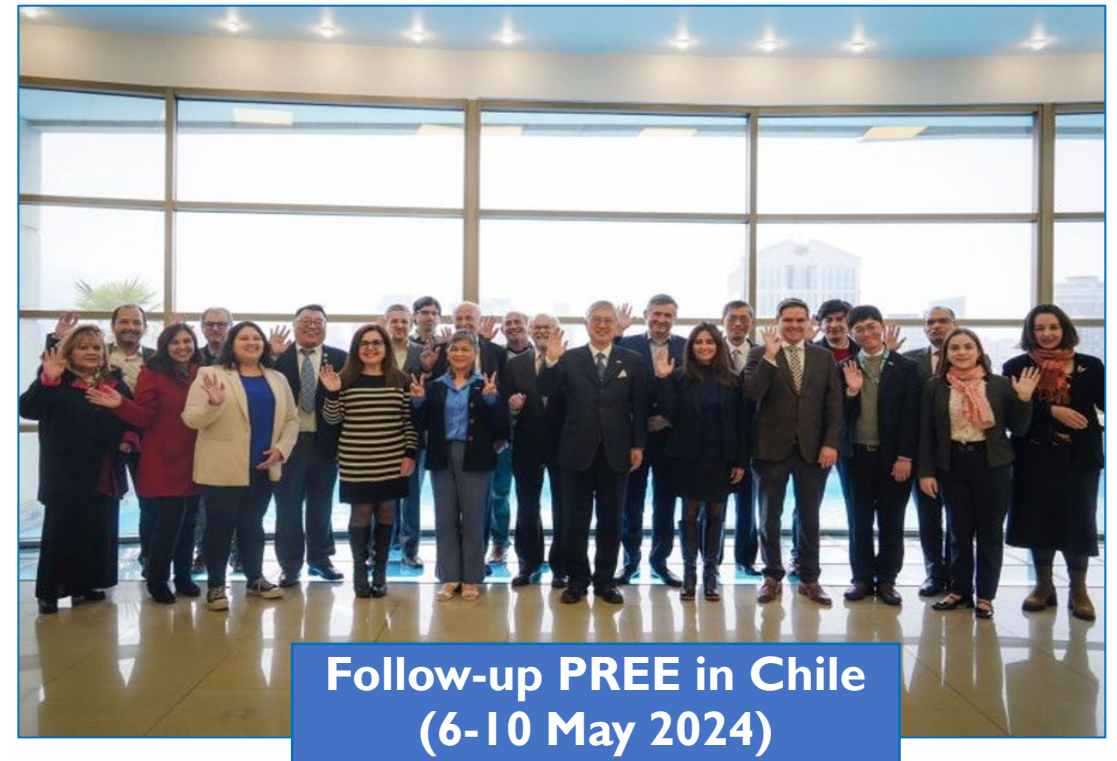
Follow-up PREE in Chile (6-10 May 2024)