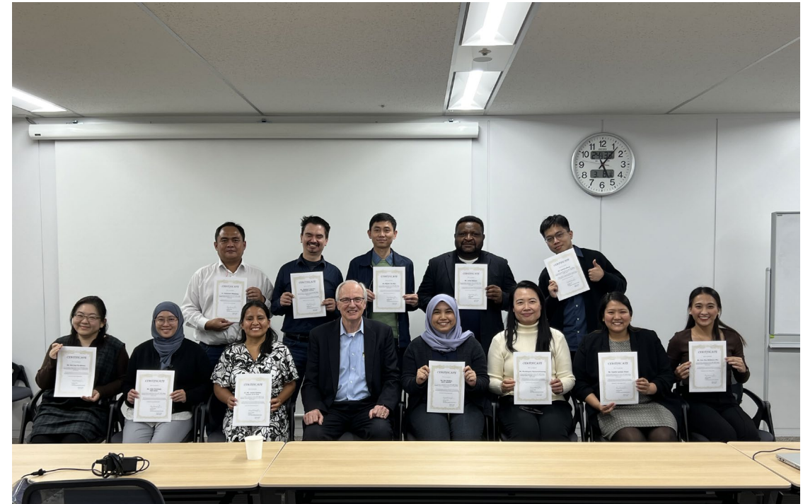
30 th APEC energy modeling seminar held in Tokyo in March 2024